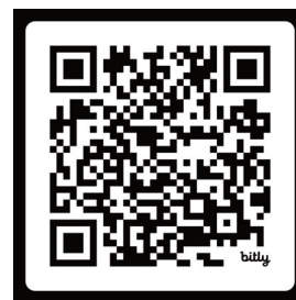
Community Resources www.ehsd.org

Located on the University of California Berkeley campus, provides comprehensive eye care to members of the campus and the local community. Accepts Medi-Cal, private pay, and insurance.