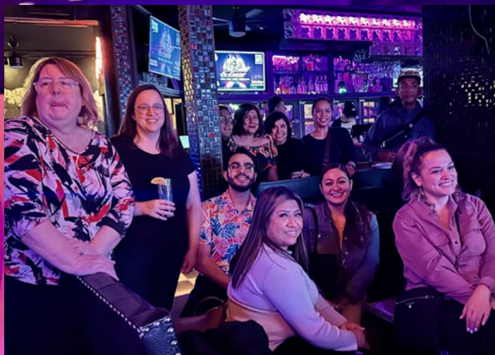
More than 150 EHSD employees cheered on their contestant friends and fellow employees.