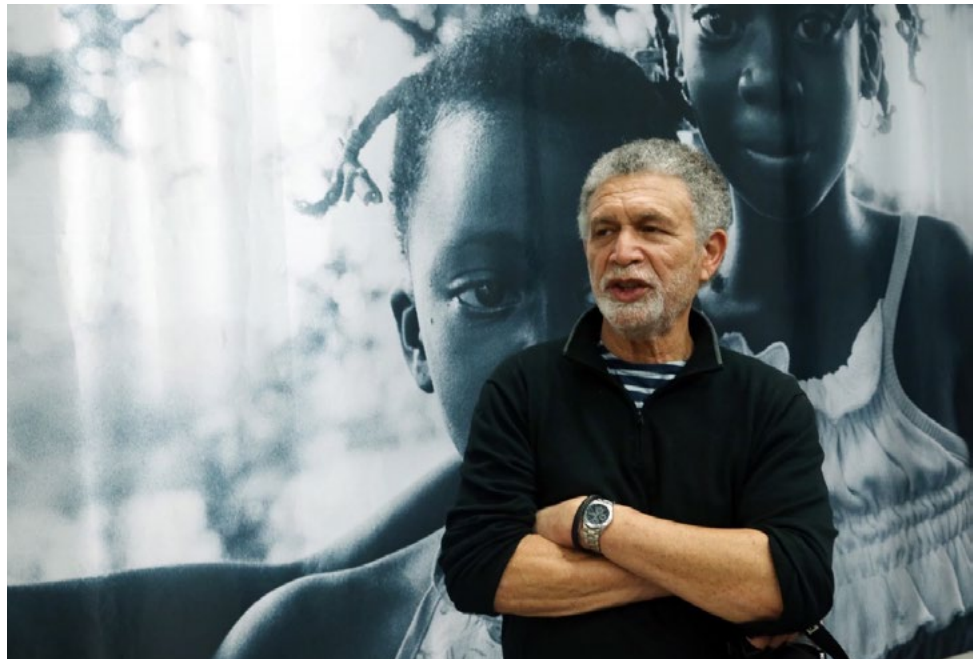
Photographer Lewis Watts: Black Portraiture(s) Conference, Newark NJ (2022)