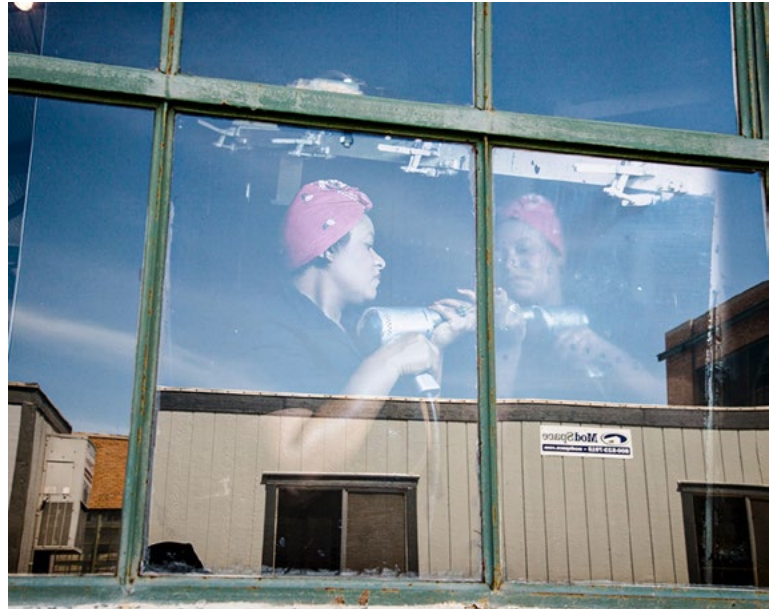
Installation, Rosie the Riveter Visitor's Center, Richmond CA (1983)