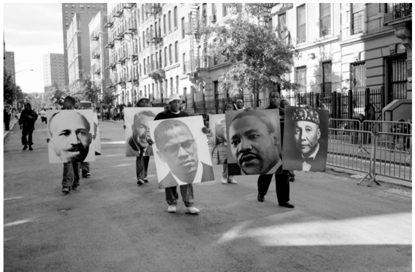
African American Parade, Harlem NY (2007)