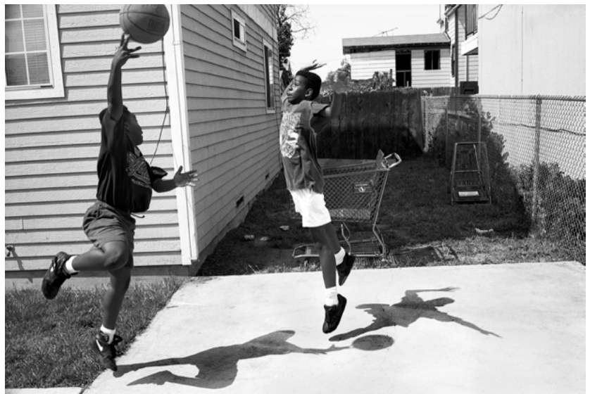
Martin Luther King Way, West Oakland (1993)