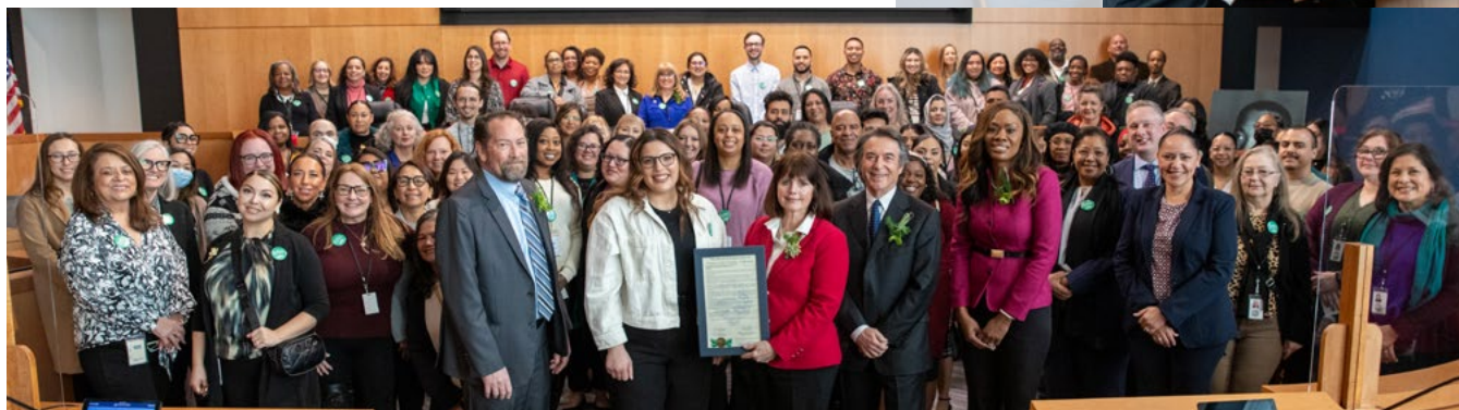
EHSD Eligibility Workers received a standing ovation as the Board of Supervisors proclaimed January to be Eligibility Work Month.