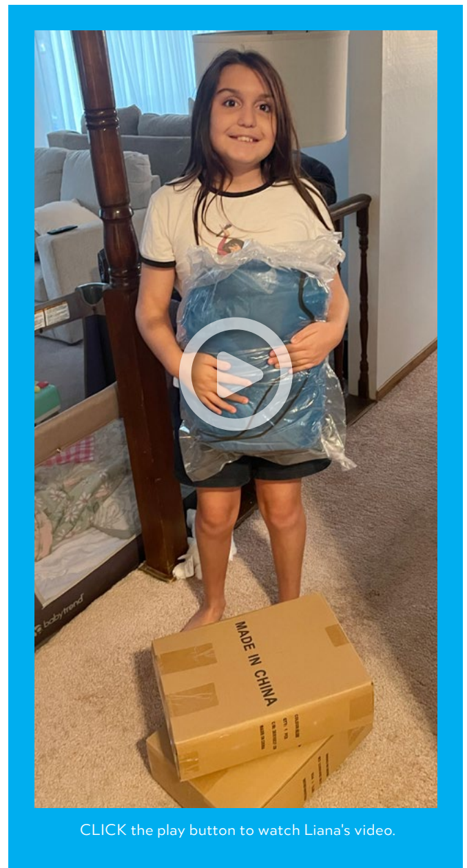
CLICK the play button to watch Liana's video.