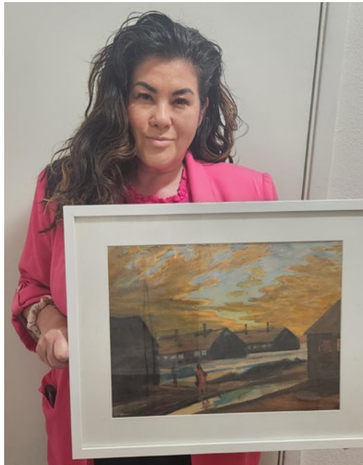
Under the Guard Tower: The Watercolors of Chikaji Kawakami is curated by Lydia Nakashima Degarrod, depicts life outside the barracks and documents the harsh living conditions during incarceration (Iwami, 2024).

few other art teachers were allowed to teach. But they were under strict guidelines on what they could paint which included censorship of the guard towers and the barbed wire surrounding the camp. With these guidelines or rules in place, the artists were still able to depict the harsh conditions while also showing the beauty within.