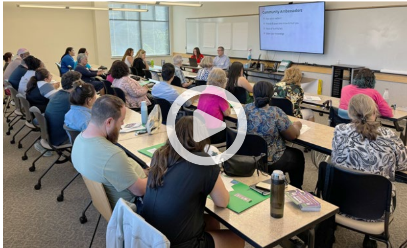
Click on the arrow to view this video to learn more about secure elections in Contra Costa County.

understand the many steps and precautions are in place to ensure that only eligible voters vote, every legitimate vote is counted, and the county’s election system is secure from fraud.