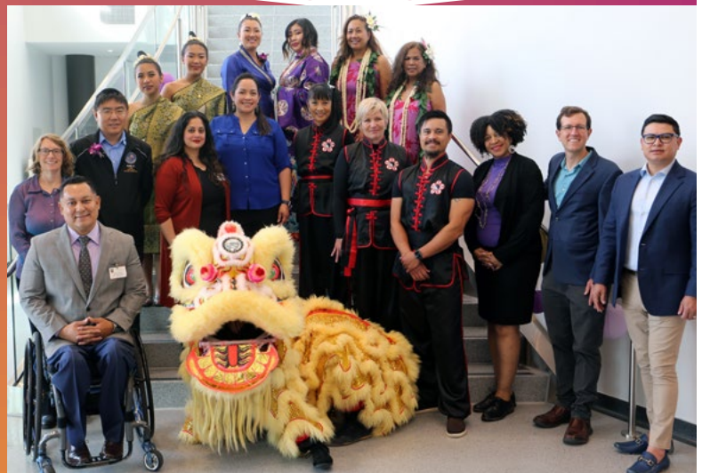
Performers, special guests, and event organizers at the 2023 AANHPI event.