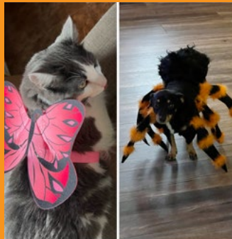
Logan & Mylo – Bugs Chinda On , Front Desk Clerk, WFS