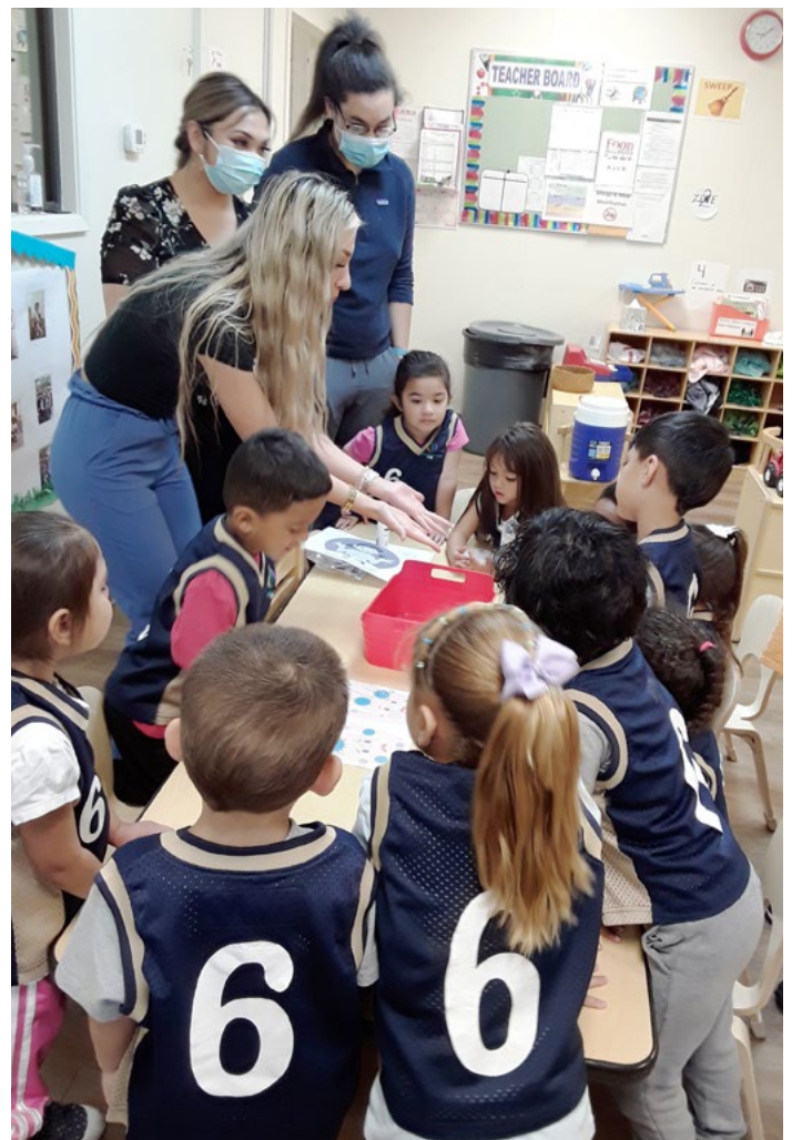
Cal State East Bay Nursing Students conducting a germ activity with the children at George Miller Center in Concord.

learning activities. The children benefit from the enhancements to health and safety topics. The teachers gain new ideas to support them in the classroom. The families receive health and safety information to encourage learning at home.