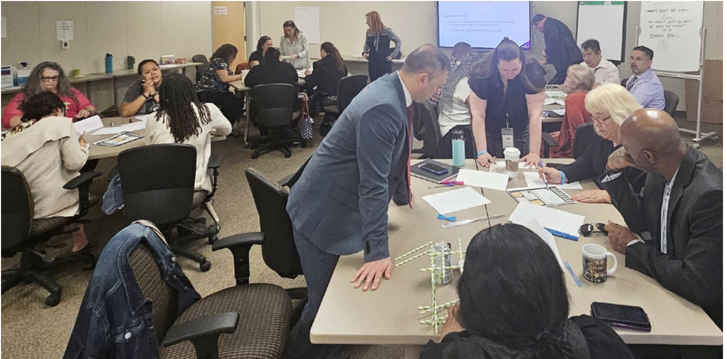
Mentors and Mentees working together to solve the exciting and challenging puzzles during the Escape Room activity.