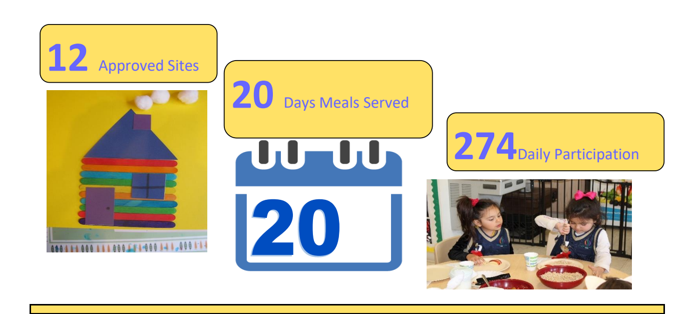
13,131 Meals Served