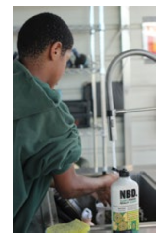
Rule number one when cooking in the kitchen: wash your hands.

instructions about the do's and don'ts of cooking, while learning food safety and hygiene tips from Farmer Mary. In no time, the outdoor kitchen was buzzing with hand washing, chopping and questions. Over the two-hour workshop, one thing was for certain — the youth were sharing a sense of community