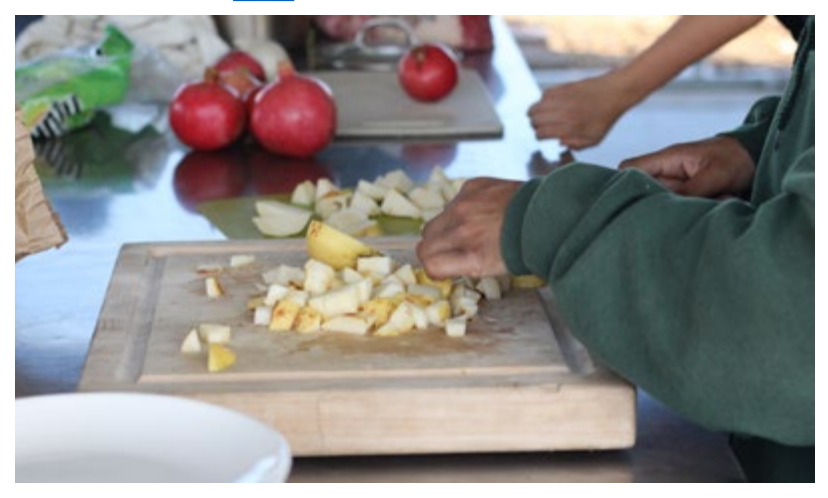
Farmer Mary coaches the youth on food safety and how to cut vegetables properly.

As the sunset illuminated the farm, the group enjoyed a vegan squash salad with steamed Basmati rice, and those who finished a little early explored the open area together. ILSP hosted another cooking class in November as well. You can view their events on ILSP's beautifully redesigned website here.