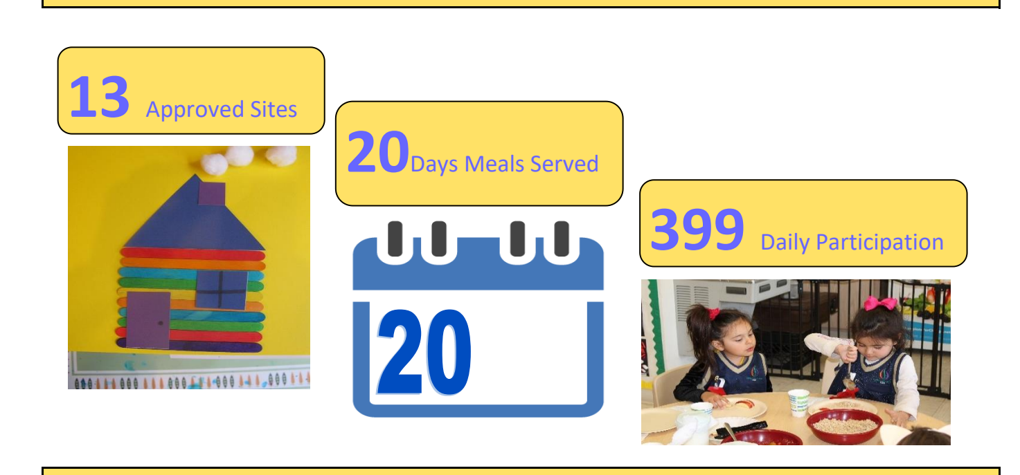
19,690 Meals Served