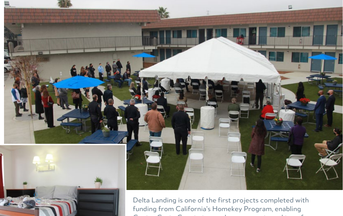
Delta Landing is one of the first projects completed with funding from California's Homekey Program, enabling Contra Costa County to purchase, renovate and transform a motel into interim housing. CCHS celebrated with a grand opening event on December 6th, 2021.

Delta Landing is one of the first projects completed with funding from