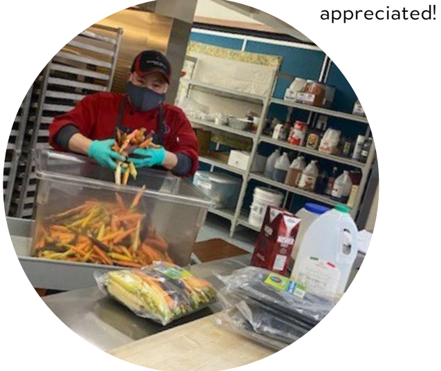
CNU staff preparing fresh carrots for HS centers

Our Child Nutrition Unit staff feel so loved and