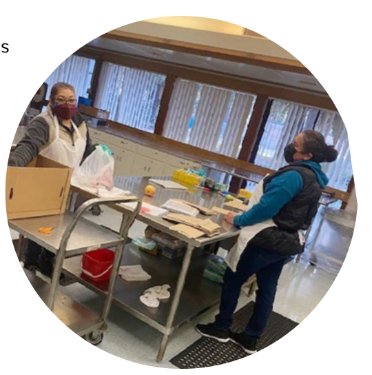
CNU staff preparing healthy meals to deliver to Head Start (HS) and Early Head Start centers

During this year's weeklong "Pride in Food Service